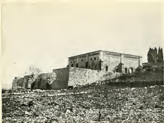
TOMB OF THE BAB ON MOUNT CARMEL